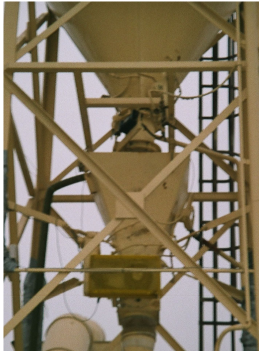
Figure 4: Hydrated lime is dispensed from the silo through a weigh pot