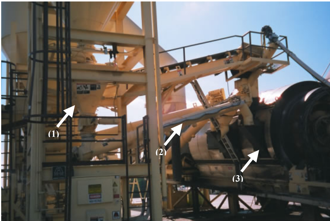
Figure 2: Weigh pot (1) dispenses hydrated lime through rotary vane feeder that feeds hydrated lime into a screw conveyor (2) and is then injected into outer shell of double drum (3).