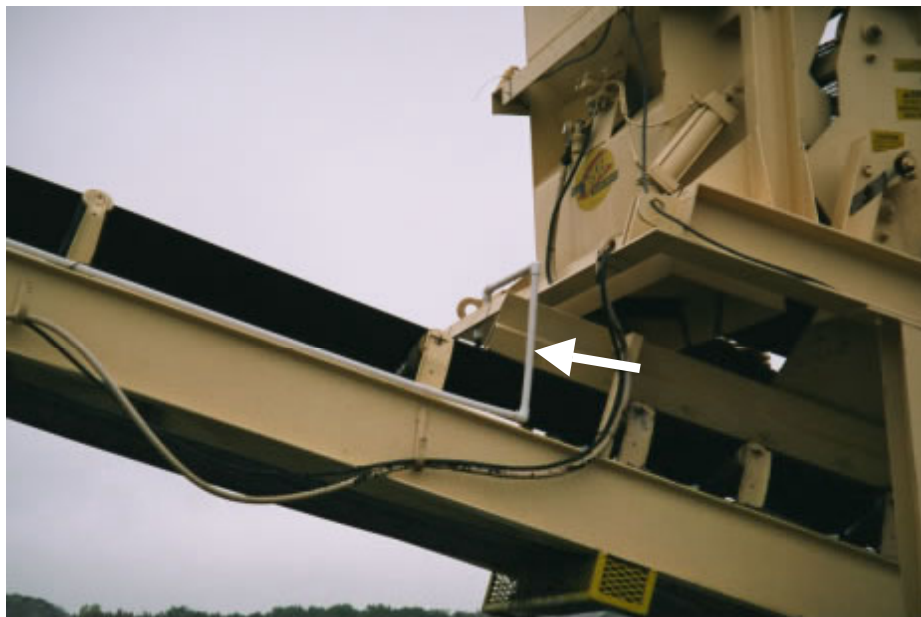
Figure 5: Water delivery system mounted over aggregate belt conveyor (see arrow)

Hydrated lime is mixed with dampened aggregate in a twin-shafted pugmill. From the pugmill, the hydrated lime-aggregate material is transferred to the drum mixer. At this plant, hydrated lime is included in all mixes at a concentration of one percent by mass of virgin aggregate. All baghouse fines are returned to the mix to ensure that no hydrated lime is lost.