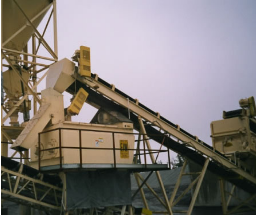
Figure 3: Hydrated lime added to aggregate & mixed in a pug mill.

This section provides an overview of adding hydrated lime to aggregate in a pug mill. The photos illustrating this application (Figure 3) are from a plant in South Carolina. The hydrated lime storage silo has a capacity of about 35 tons, which is enough for one day's production of HMA. The silo is replenished by pneumatic delivery from road tankers. Hydrated lime is dispensed from the silo through a weigh pot (Figure 4) and transferred to the pugmill by a conventional screw conveyor.