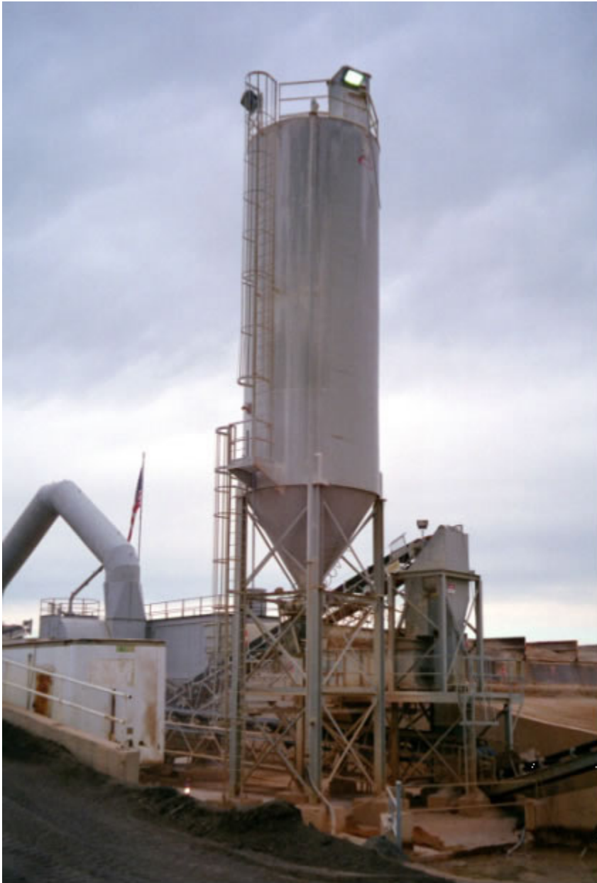
Figure 8: 80-ton hydrated lime storage silo, which is filled pneumatically via underground pipe because of restricted access.

The first plant is equipped with an 80-ton vertical hydrated lime storage silo, which is refilled pneumatically via an underground pipe because of restricted access (Figure 8). Hydrated lime is