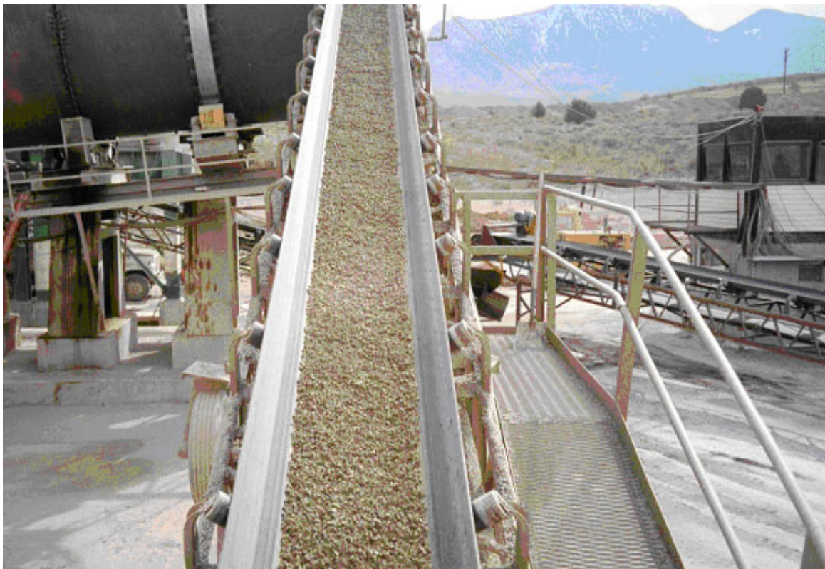
Figure 11: Lime-treated aggregate headed to dryer drum.