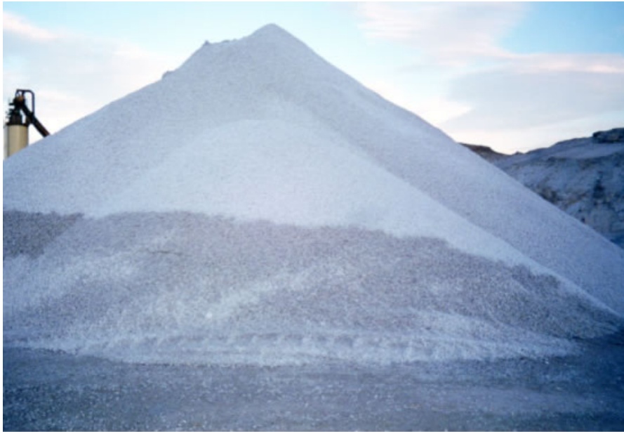
Figure 7: Hydrated lime-coated aggregate stockpiled to marinate.

The hydrated lime-coated aggregate discharges from the pugmill onto a transfer conveyor for stockpiling (Figure 7). Nevada DOT requires stockpiles to marinate for at least 48 hours. Nevada DOT requires the marinated aggregate to be used within 45 days.