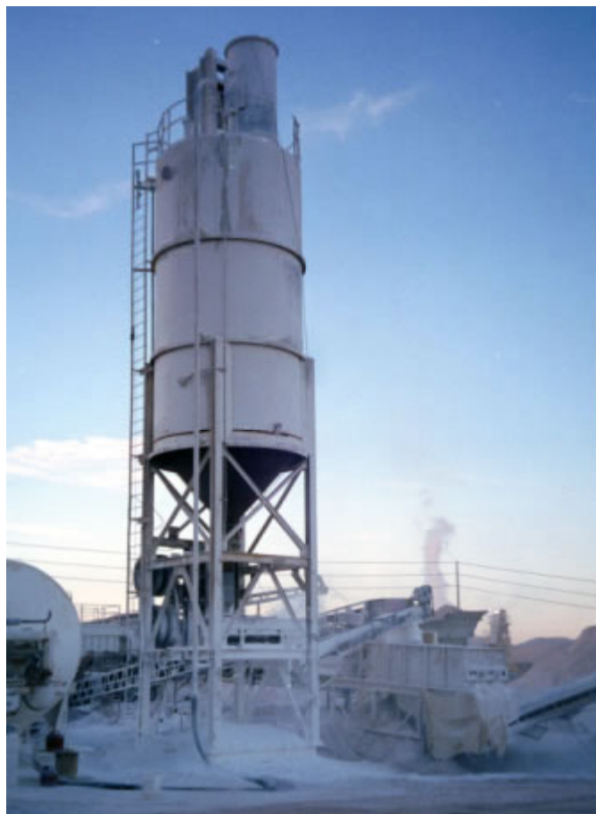
Figure 6: 80-ton vertical silo for hydrated lime.

This section provides an overview of treating moist aggregate with dry hydrated lime followed by marinating the treated aggregate. The procedure is illustrated by a plant in Nevada. Hydrated lime is transferred pneumatically from supply tankers into an 80-ton vertical silo (Figure 6). The