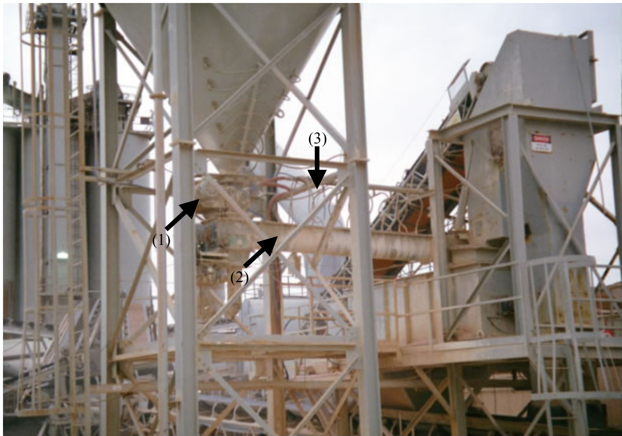
Figure 9: Hydrated lime metered volumetrically through calibrated rotary vane feeder (1) into screw conveyor (2). Water introduced via nozzles located above the screw conveyor (3).

metered volumetrically through a calibrated rotary vane feeder into a screw conveyor and water is introduced via a number of nozzles, which are located above the screw conveyor (Figure 9). The hydrated lime-treated material is discharged from the pugmill onto a conveyor belt for transit to the drying, heating, and mixing process.